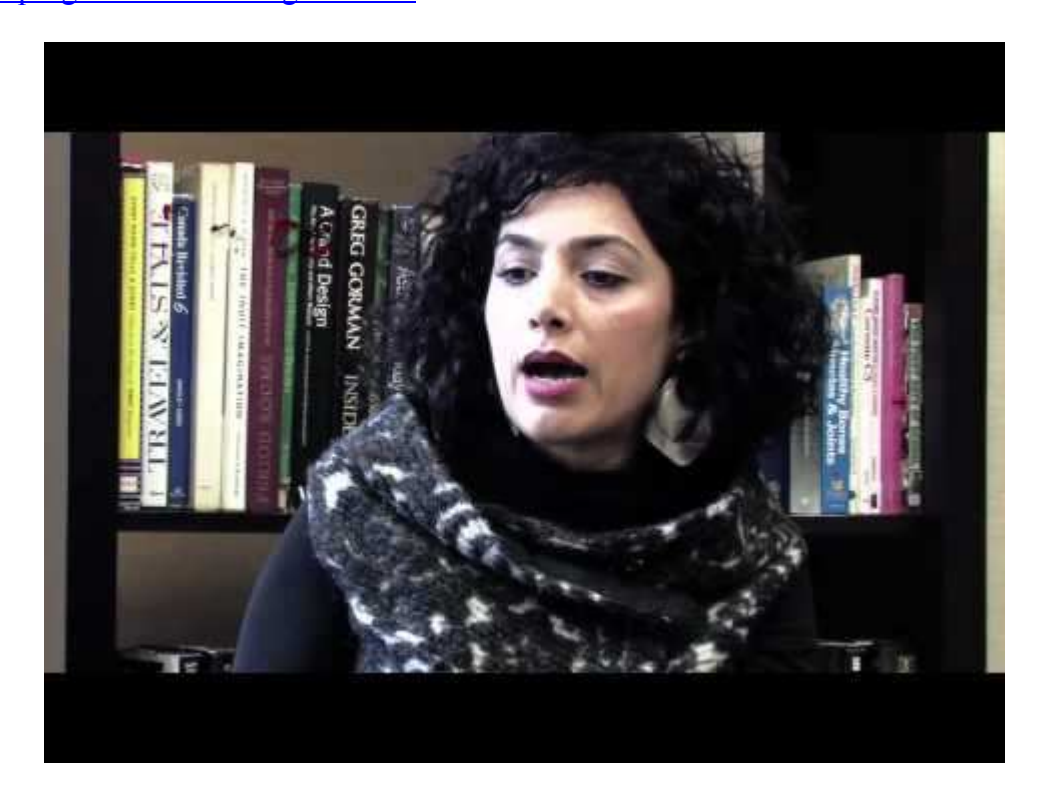
Tirgan Festival July 21-24, 2011 in Toronto, Canada